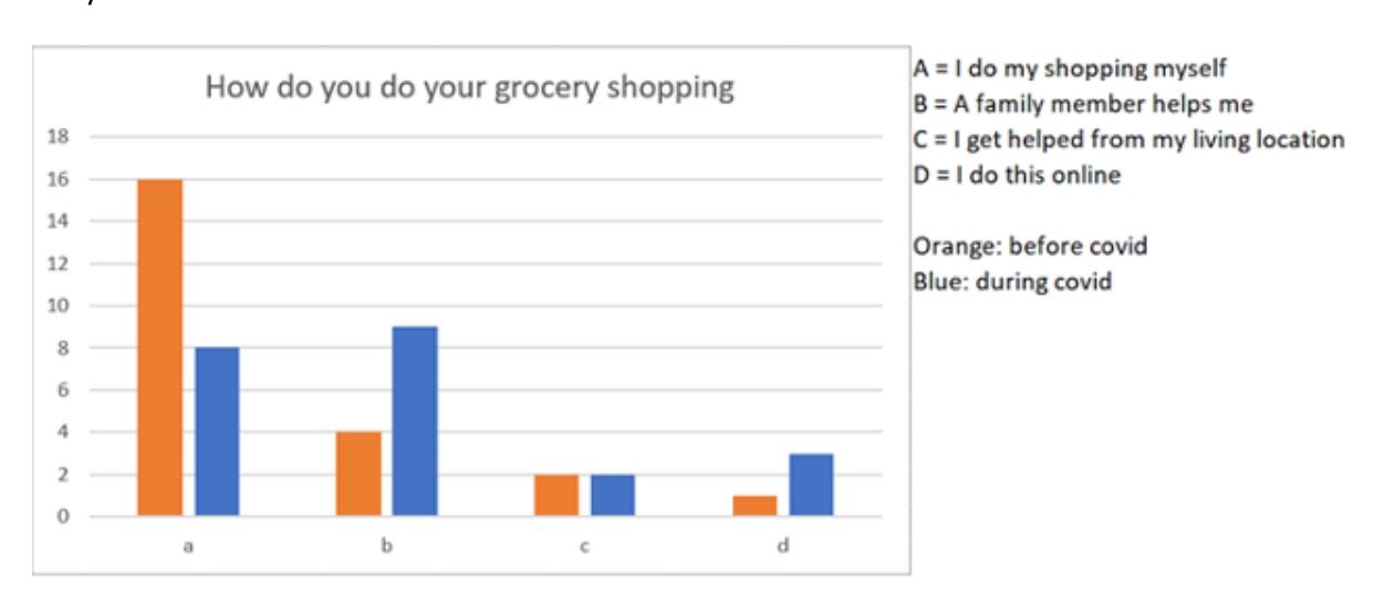
Figure 1 – Change in grocery shopping behaviour amongst seniors

However, when looking at the data in Figure 1 from during the Covid lockdown only 7 of the seniors said they did their own shopping. A lot of these being taken over by people getting helped by family or friends, with this statistic shooting up to 10 from the 3 it was at before the lockdown. In addition, the amount of seniors using online options went up to 3 from 1 before. From this data we can conclude that where the seniors are still physically able to do the shopping they no longer do, most likely out of fear for the virus which of course is most lethal to seniors.