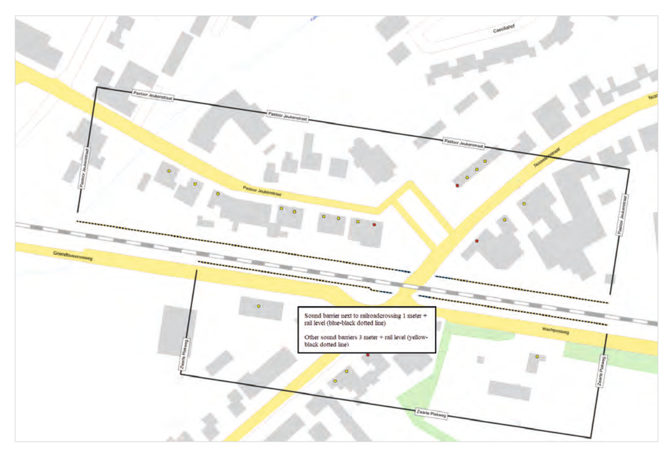
BS = Rail top: the height of the sound barriers is always measured from the top of the rails; this measurement does not depend on the local situation.